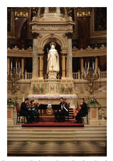
Concert at Budapest Saint Stephan Basilica